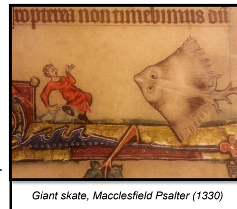
Giant skate, Macclesfield Psalter (1330)

Last year a new MPA (Marine Protected Area) was announced to protect the common skate, one of the world's most endangered fish. The Loch Sunart to the Sound of Jura Nature Conservation MPA encompasses the top half of the Sound of Jura, Scarba and the Garvellachs and runs north to the western entrance to the Sound of Mull. The common skate is the largest skate in the World - it can reach a length of 2.5 m and weigh over 100 kg. It used to be abundant all round the UK but now is restricted to areas of the west coast of Scotland and Orkney. The main cause of this has been unsustainable levels of fishing, and while there are major issues with enforcement and there are still areas in the mouth of Loch Craignish and on the west of the point where bottom-towed fishing is permitted in certain conditions, it is now banned in the majority of the area. Here is a zoomable map .